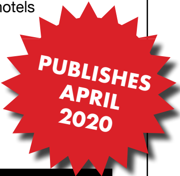
Talbot County Chamber of Commerce 2019-2020 Business & Community Directory

The directories will be used by area employers for recruitment and will also be distributed at banks, real estate offices, hotels and offices. The Business & Community Directory will serve area residents, newcomers and visitors.